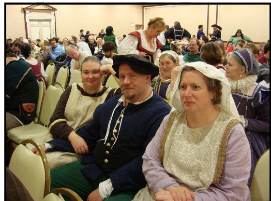
Members of the Shire wait for court at the Festival of Maidens in January.