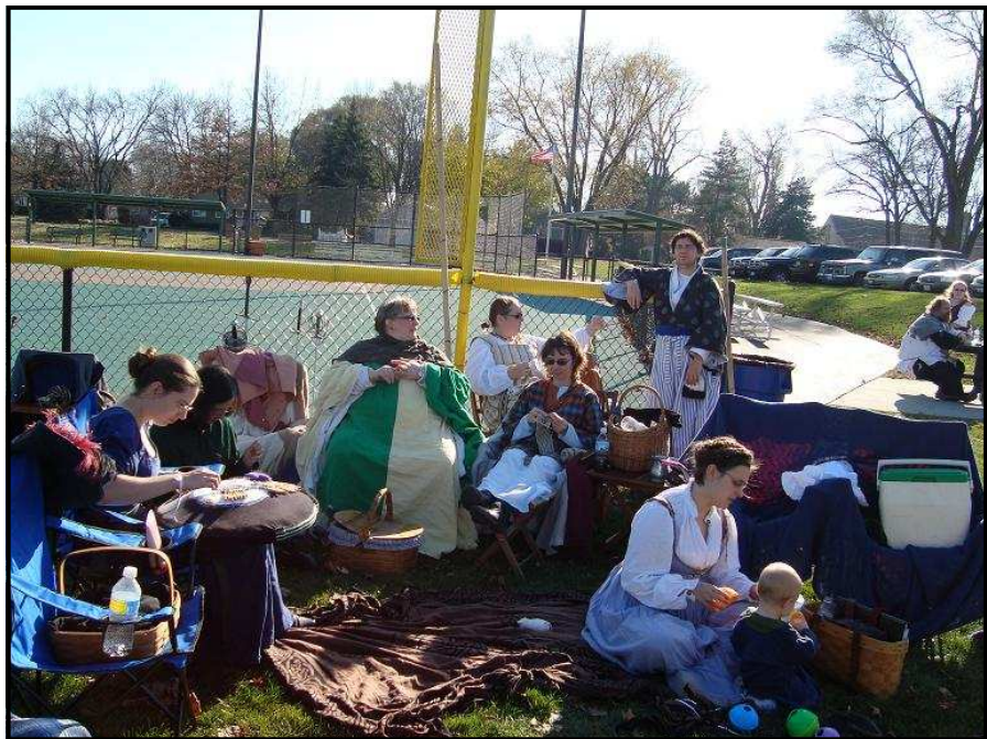
Members of the Shire gather at the All Souls event in November. .